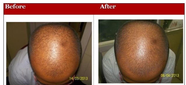
Figure 2: Patient 1: Before and after neonatal MSC therapy.

Around 28 subjects showed less than 25% improvement (mild response). 10 subjects showed a moderate response (25-50% response). Before and after photographs showing improvement are seen in Figures 2, 3, 4 & 5.