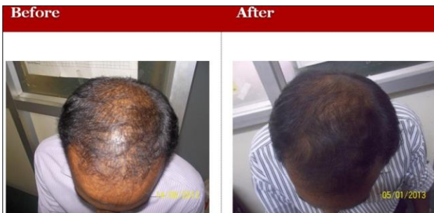
Figure 4: Patient 3: Before and after neonatal MSC therapy.