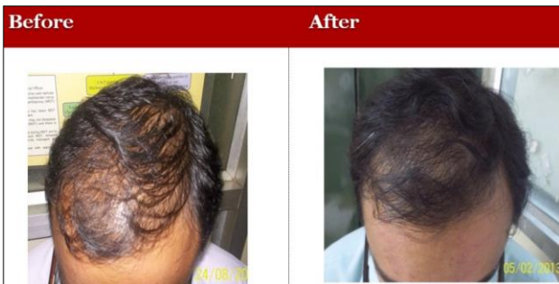
Figure 5: Patient 4: Before and after neonatal MSC therapy.

One patient had a mild anaphylactic reaction 3 to 4 hours after the procedure with mild urticarial rashes, which subsided on antihistamine treatment. Apart from this no other adverse events were recorded.