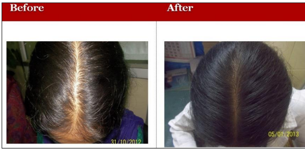
Figure 3: Patient 2: Before and after neonatal MSC therapy.