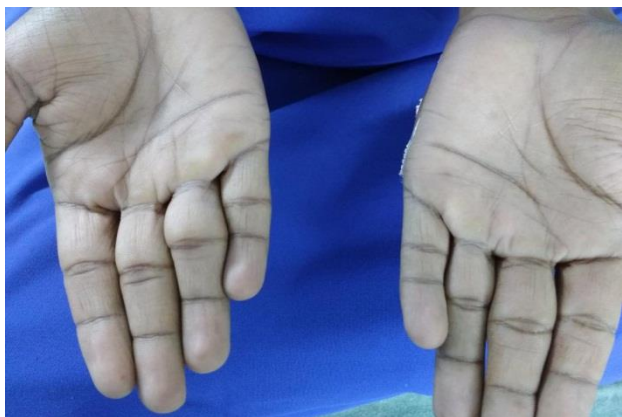
Figure 4: Incurving little fingers.

Although similar in some ways to true hermaphroditism, the conditions can be distinguished histologically and by karyotyping. 6 The observable characteristics (phenotype) of this condition are highly variable, ranging from gonadal dysgenesis in males, to Turner-like females and phenotypically normal males. 7,8 The most common presentation of 45,X/46,XY karyotype is phenotypically normal male, next being genital ambiguity. 9