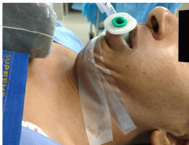
Figure 3: Difficult airway.

There are many chromosomal variations that cause the 45,X/46,XY karyotype, including malformation (isodicentricism) of the Y chromosomes, deletions of Y chromosome or translocations of Y chromosome segments. 5 These rearrangements of the Y chromosome can lead to partial expression of the SRY gene which may lead to abnormal genitals and testosterone levels.