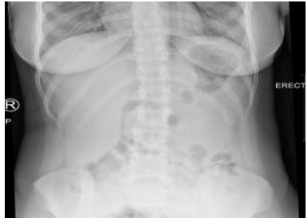
Figure 6: Plain abdomen x-ray (erect) post operation.

output of 1500 ml upon insertion to decompress the stomach and relieve the pain.