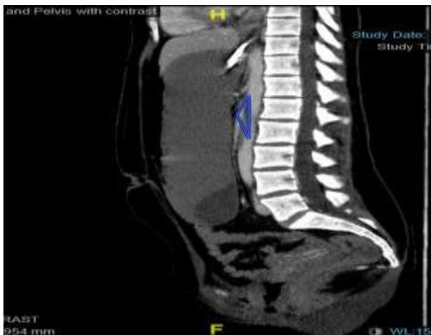
Figure 4: CT sagittal (lateral) view.

The relation between SMA and SMV were normal, and there was no malrotation. The liver, spleen, adrenals, and kidneys were unremarkable. The pancreas was compressed and displaced, occupying the C-loop of the duodenum and extended posterior to the second part of the duodenum, however, it does not encircle the duodenum. Visualized bony structures appeared grossly unremarkable.