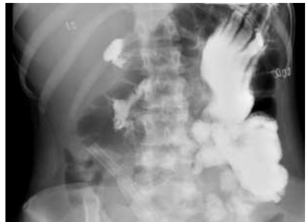
Figure 7: Gastrografin follow through study, post laparoscopic duodenojejunostomy.

The patient was on daily labs, maintained in good analgesia. Peripherally inserted central line (PICC) line was inserted to provide nutritional supplement to the patient by total parenteral nutrition (TPN). Patient was prepared for an operative room on the fifth day of admission. The patient underwent uneventful laparoscopic duodeno-jejunosotomy done side-side between the 3 rd part of the duodenum and proximal jejunal loop. Postoperatively, the patient was recovering very well during the hospital stay, remained NPO, and on TPN 72 hours post-operation. The patient started on sips of water on day 3. NGT was removed on day 4 and the diet was advanced to full liquid and she was tolerating very well adequate amount to her daily need with no vomiting or abdominal pain and TPN was stopped. The drain was removed on day 5 and the patient was discharged home on day 7 in good condition. The patient was seen in the clinic 1, 2, and 8 weeks after surgery. She was doing great, improving day by day, no more vomiting, tolerating orally well, gaining weight, and had a good lifestyle.