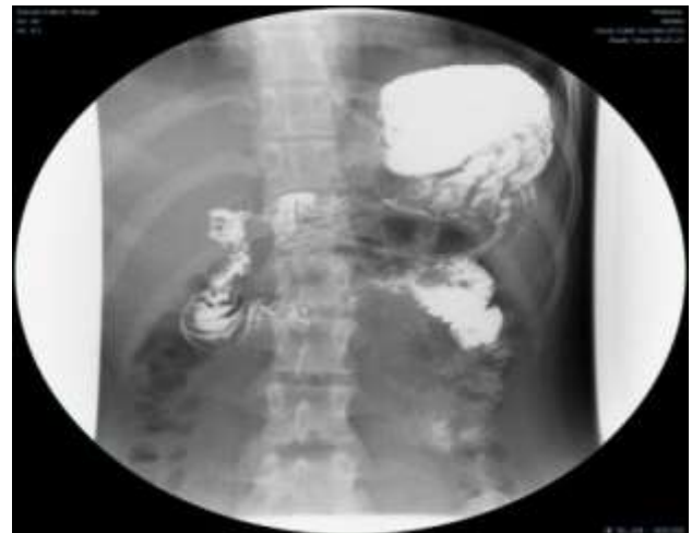
Figure 2: Barium follow through showing transient delayed emptying of the second to the third part of the duodenum.

part, which was severely compressed as it is passed between the superior mesenteric artery and the aorta (Figure 3). The aortomesenteric angle was approximately 18.5 degrees (Figure 4 and 5). There was no intra-abdominal free air. Also, no free or localized fluid collection was present.