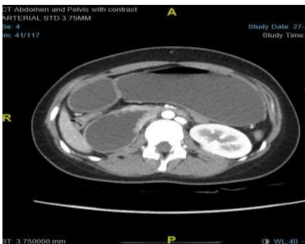
Figure 5: Preoperative CT coronal view.