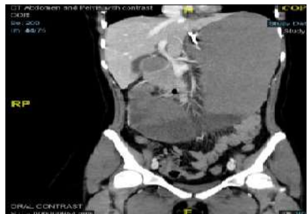
Figure 3: Pre-operative CT coronal view.