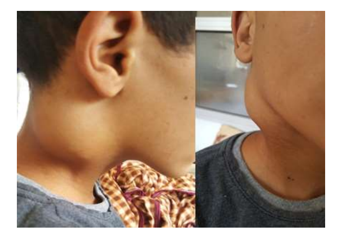
Figure 1: The right lateral cervical mass which corresponds to the cervical lymph node of the patient.

nasogastric tube. The histology of both biopsies revelead an epidermal carcinoma (Figure 2).